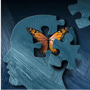
Finding Mental Health Assistance

We publish a new article regularly on The Allied Blog . Many of these topics address issues faced by small business employers. If you like these blogs, bookmark www.alliednational.com/blog and come back each Wednesday for new content!