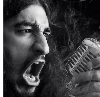
Rock on for Wellness